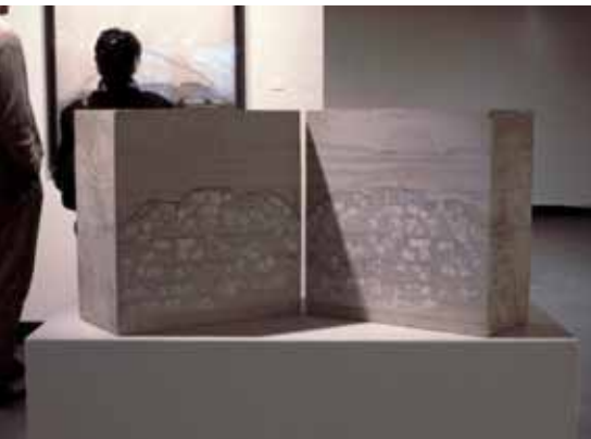
For the Tahualtapa installation, deSoto created a contemporary image of the hill with an aura showing its original height before the effects of mineral mining. He also placed concrete slabs in the installation representing cement ingredients extracted from Tahualtapa. Collection of the Seattle Art Museum.

Anya Montiel (Tohono O’odham/Mexican), a frequent contributor to American Indian , is a doctoral student at Yale University.