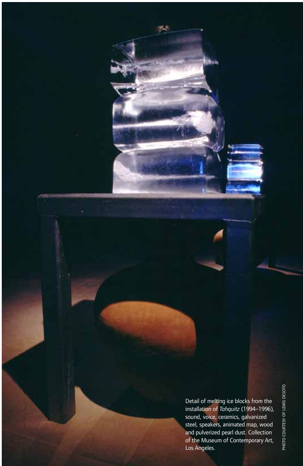
Detail of melting ice blocks from the installation of Tahquitz (1994–1996), sound, voice, ceramics, galvanized steel, speakers, animated map, wood and pulverized pearl dust. Collection of the Museum of Contemporary Art, Los Angeles.

Previously, deSoto created a work about Tahquitz, when he was invited to participate in the exhibition Landscape as Metaphor in 1991. The installation, entitled Tahquitz , travelled to various museums for several years. At the Nelson-Atkins Museum of Art in Kansas City, his installation occupied two rooms painted in dark blue with an application of pearlescent powder.